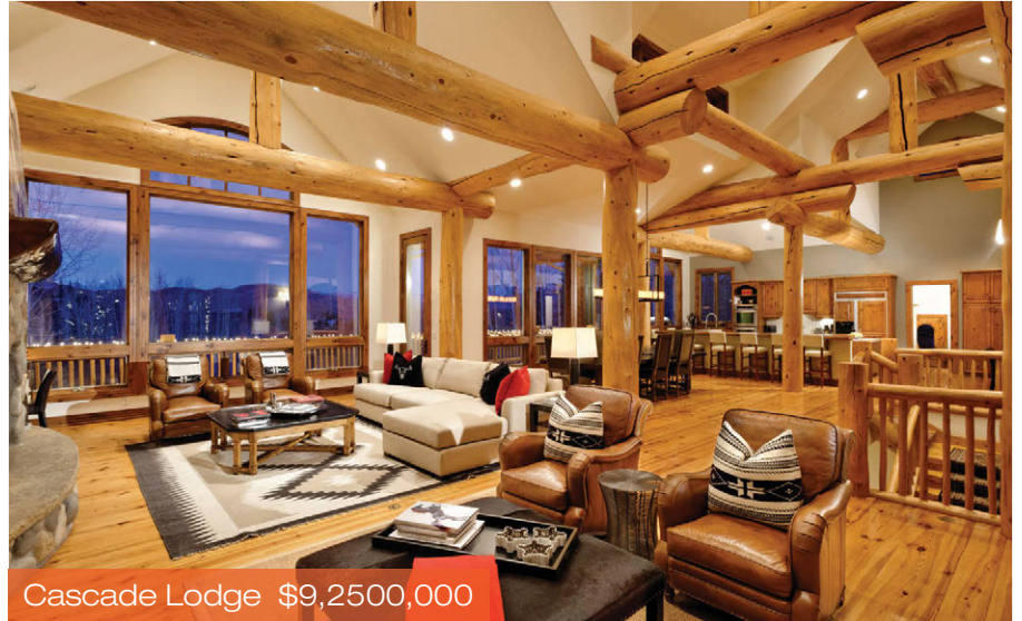
Cascade Lodge $9,250,000