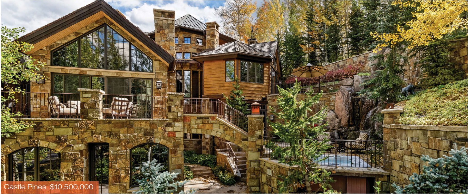
Castle Pines $10,500,000