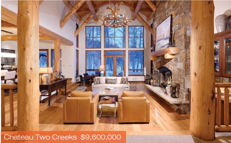
Chateau Two Creeks $9,600,000