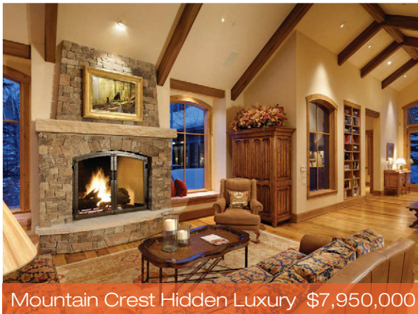
Mountain Crest Hidden Luxury $7,950,000